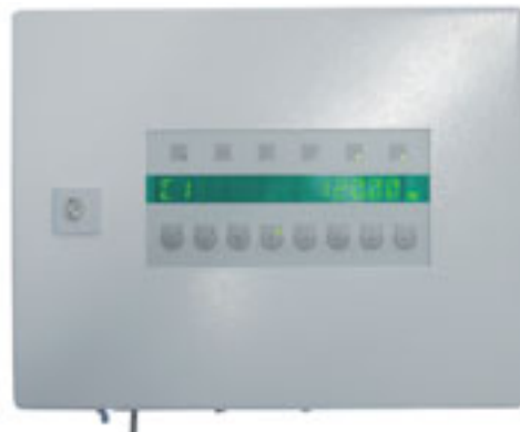
Automatic MSDL hopper scale with MEAG universal control unit.