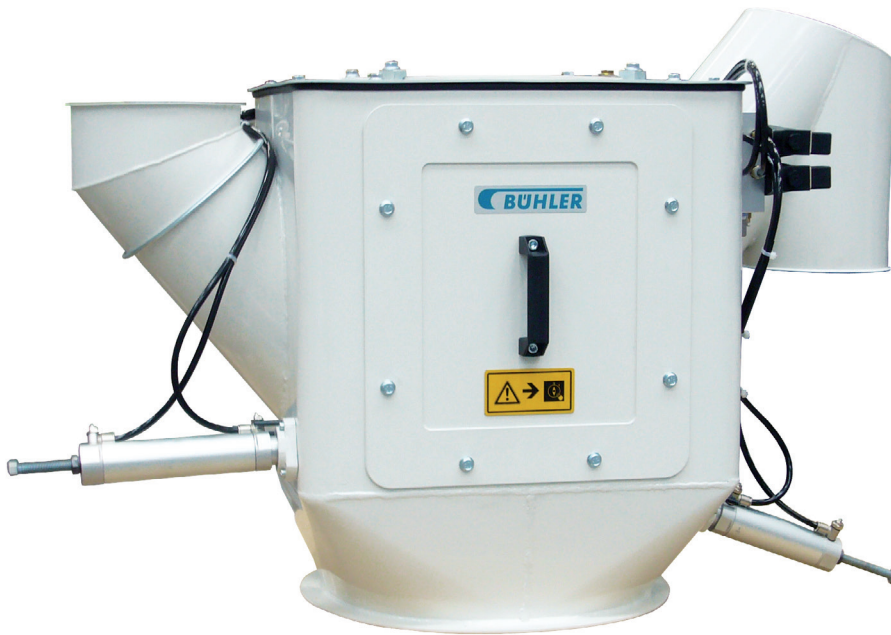
MWSU double slide-gate feeder Accurate feeding.