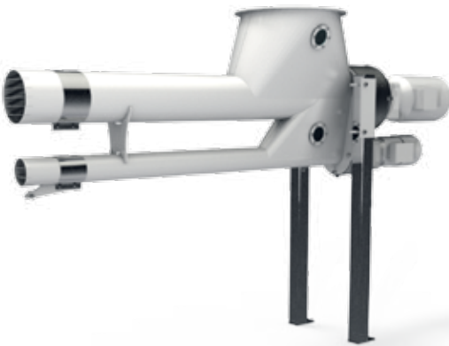
Twin-screw feeder supported on floor.