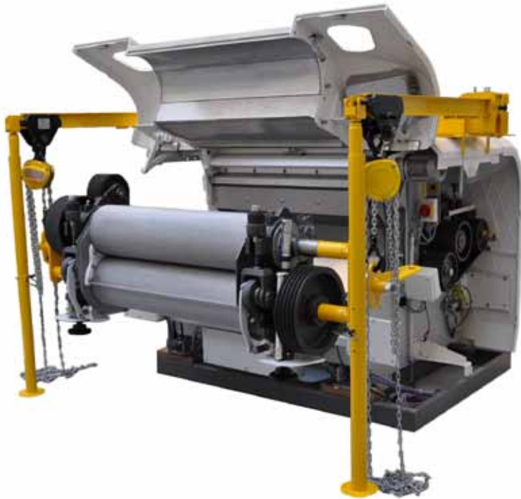
MDDX Universal Roll Removal Device.

This Buhler service and its specially trained personnel guarantees short downtimes through optimal support of work processes.