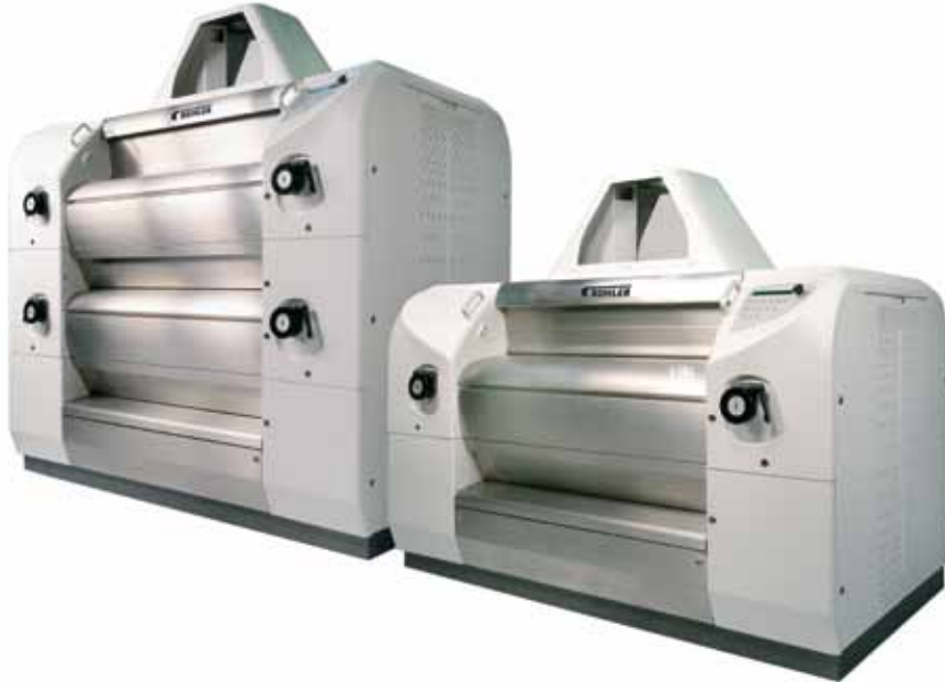
Antares Four and Eight Roller Mill MDDR and MDDT.

Rolls are the flour miller's most important tool. They have a direct influence on the flour extraction rate and on the quality of the end product. But rolls are wear parts requiring regular maintenance.