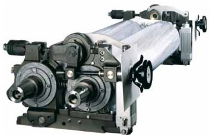
Roll pack with self-contained forces.

Buhler rolls are neither too soft nor too hard. They have a uniformly structured outer layer of chilled cast iron with consistent hardness and structural properties. Buhler rolls are manufactured to the tightest of tolerances in terms of corrugation (fluting) geometry, camber, and concentric running.