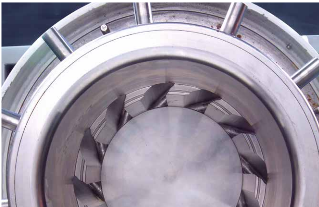
View inside the MicroMedia™ X process chamber

With this conversion kit, Bühler makes it possible to benefit from the process engineering advantages of the MicroMedia™ X, even for older machine systems (Advantis™, Cosmo™ and SuperFlow™). For this purpose, an individual conversion package is put together that reduces conversion costs to