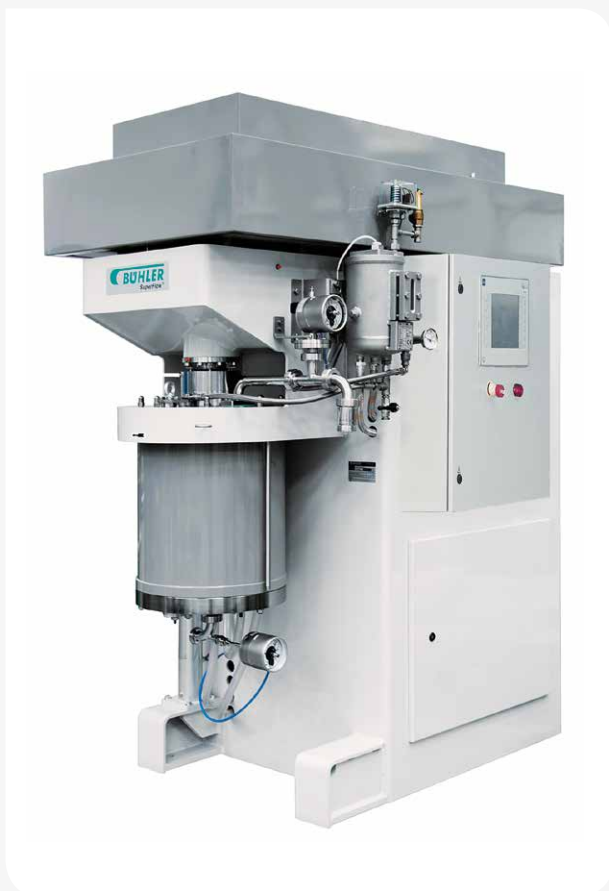
Available for Advantis™, Cosmo™, SuperFlow™