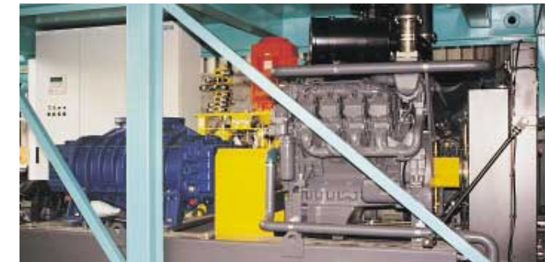
Rotary piston blower with diesel engine.