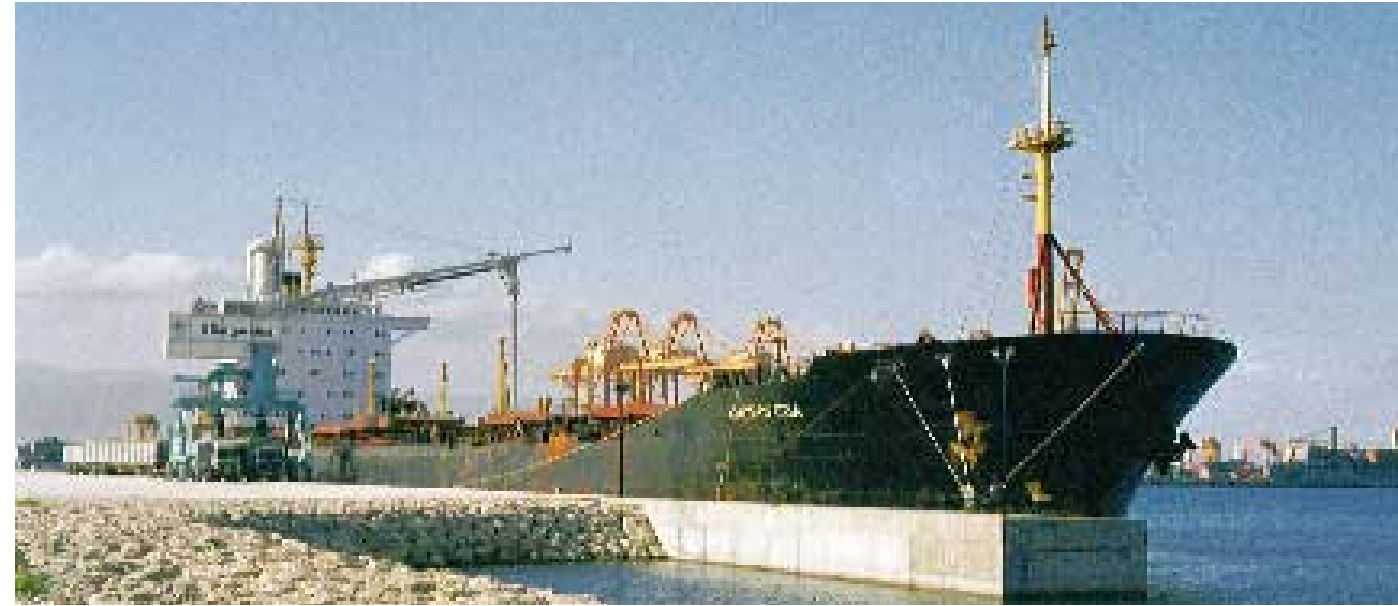
Portanova 2500/60T in Oman.