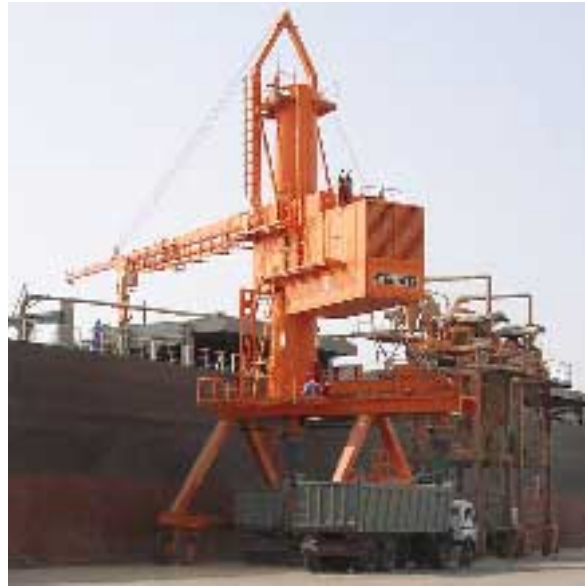
Portanova 2500/60T in Saudi Arabia.

The Buhler Portanova is a pneumatic ship unloader designed for efficient unloading of grain and oilseeds. The unloading throughputs vary from 250 to 345 metric tons per hour (t/h) on the basis of grain, depending on the specific ship size. The Portanova is distinguished by its high degree of mobility and availability as well as by its outstanding cost-to-benefit ratio.