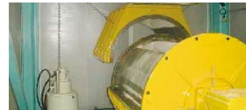
Split special airlock.