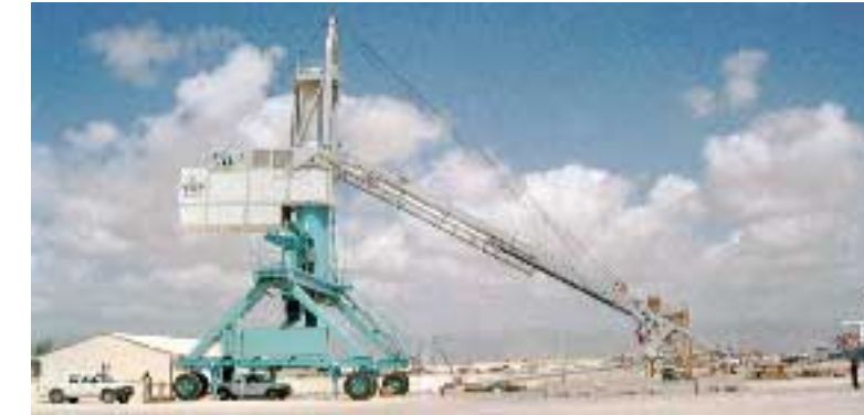
Boom lowered for maintenance.