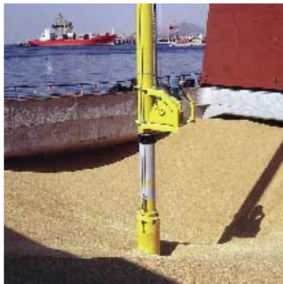
Telescopic pipe winch with adjustable suction nozzle for material intake.

A reliable, global customer service ensures dependable operation and high availability of the systems supplied.