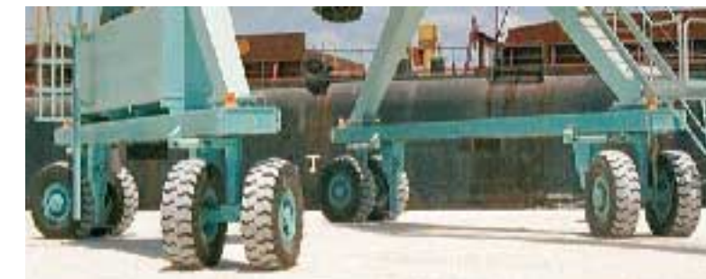
Steerable rubber-tired traveling gear.