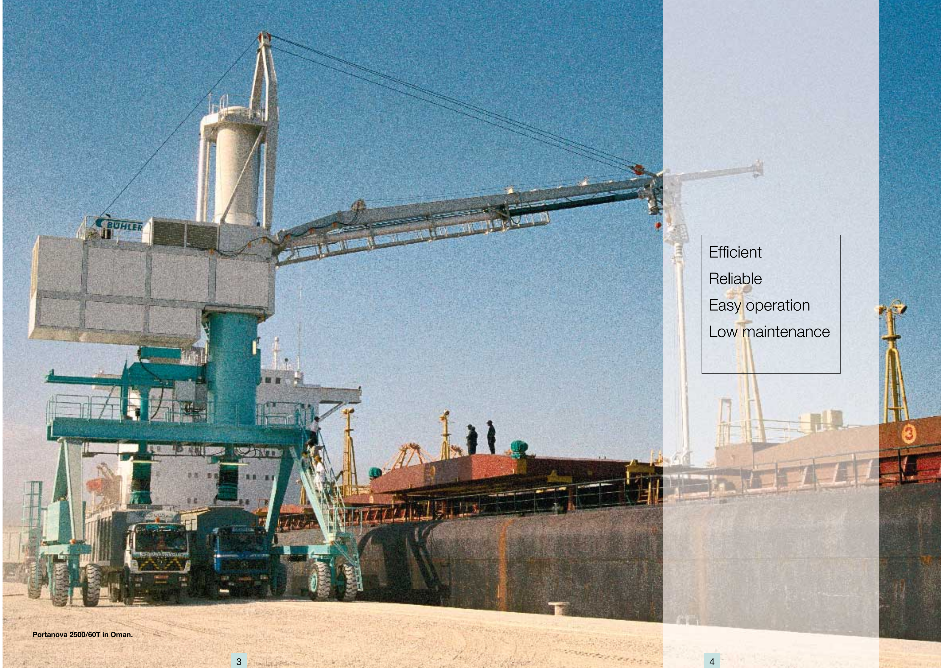
Portanova 2500/60T in Oman.

Efficient Reliable Easy operation Low maintenance