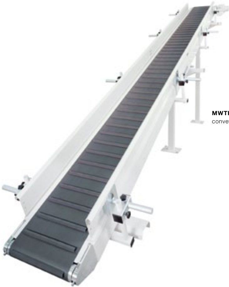
MWTB bag belt conveyor – for inclined conveying up slopes of up to 25°.