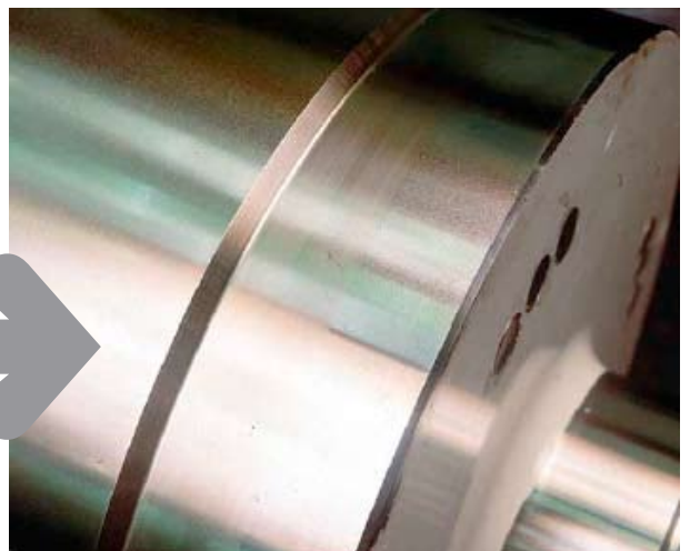
Optimal roll surface and edges after reconditioning.