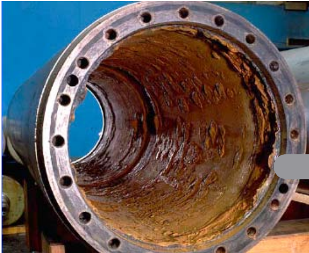
Deposits of rust, algae, scale, etc. on the inside of the roll.