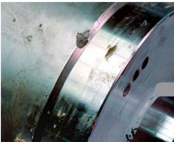
Pitting on the roll edge (example of roll damage).