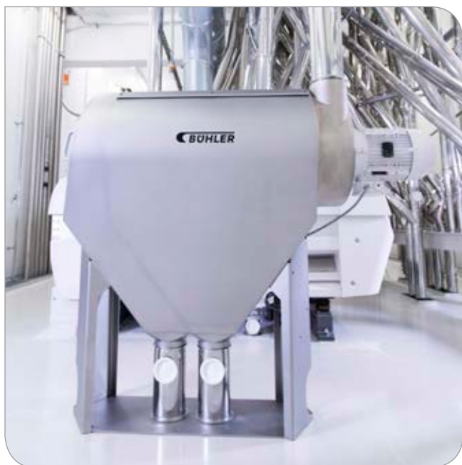
High capacity and optimum hygiene thanks to new design and direct drive.