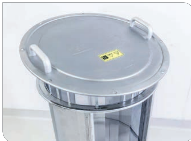
The screen of the stainless steel sieve frame can be exchanged.

Easy maintenance. Outstanding accessibility for regular production checks.