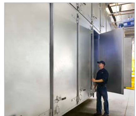
Complete interior access for cleaning and maintenance.