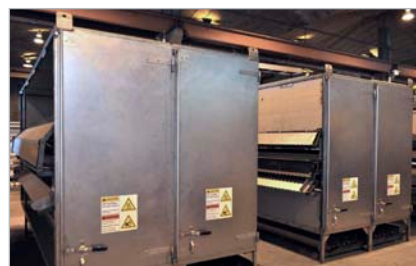
AeroDry equipment ships in large modules for quick, cost-efficient installation.