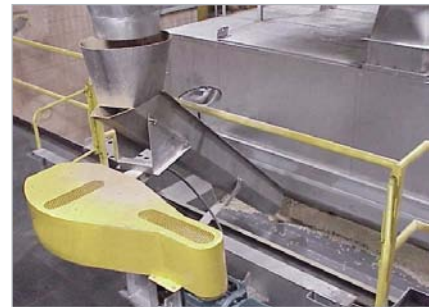
AeroFeed OS+ oscillating spout feeder with online adjustment ensures even product loading.

Consistent Product Feeding. The AeroFeed OS+ oscillating spout feeder ensures consistent drying by spreading product evenly across the conveyor bed. Adjustments can be made while in operation without interrupting production.