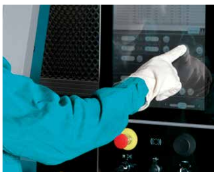
Convenient operation with multi-touch screen