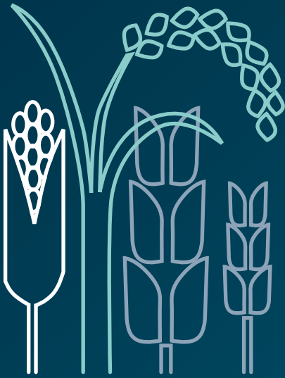
raw material handling

Bühler offers complete solutions covering all stages of ready-to-eat cereal production. From raw material handling, cleaning and storage, to flaking, extruding, coating and drying. Visit buhlergroup.com for more information.